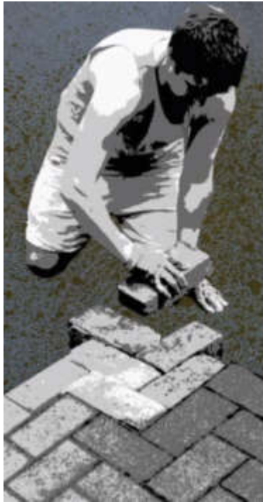
Laying your driveway